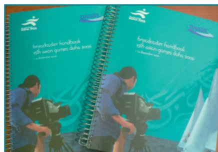
Essential reading - the Broadcaster Handbook

The DAGBS Broadcaster Handbook (left) acts as the chief portable reference to the 15th Asian Games Doha 2006. The Handbook contains detailed information on the Asian Games and DAGBS coverage. The distribution of the DAGBS Broadcaster Handbook will commence on 15 November. BIO staff will deliver the Handbooks directly to Rights Holders. Handbooks will not be dispensed at the BIO counter.