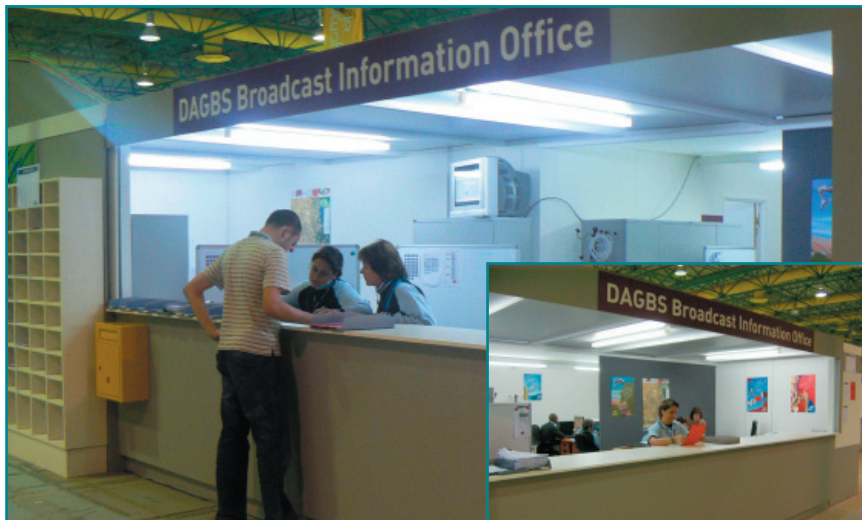
The DAGBS BIO - the answers to your questions

The BIO Counter (the Front Office) is the central information point for Rights Holders, where information officers will assist in providing over-the-counter information and where the bulletin boards and pigeon holes are located.