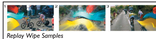
Replay Wipe Samples

A simple yet strongly identifiable set of opening sequences and replay transitions are also in production and some samples are shown in the boxes above.