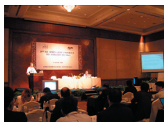
The 38th ABU Conference

The Asia Pacific Broadcasting Union (ABU) held its 38th ABU Sports Group Conference on 9-10 May